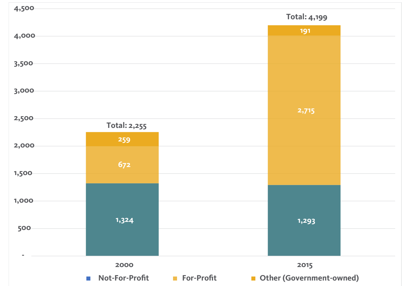
Figure 3. Growth in Number of Hospices by Ownership (Profit) Status from 2000 to 2015

Hospice is an attractive venture for private equity investors. Although mergers and acquisitions slowed during 2015-2017, they increased in 2017 along with overall growth in the industry. With increased consolidation trends and regulatory scrutiny, the number of not-for-profit providers is likely to decrease.