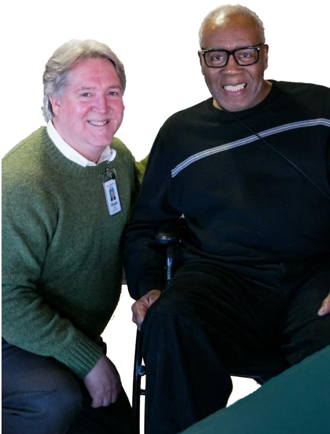
Asbury Methodist Village, MD

—Peter Drucker, Managing the Nonprofit Organization