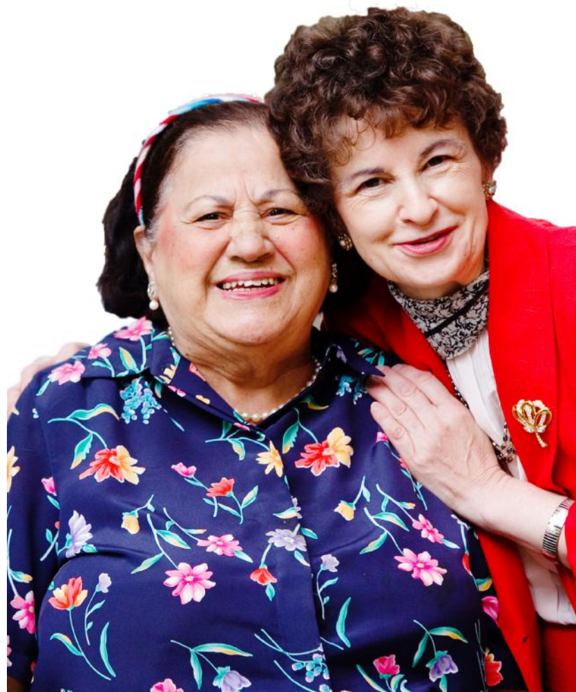
St. Mary's Court, Washington, DC